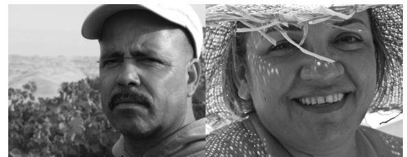
Table 4.5 Responses of Coahoma County Residents to Job-Related Issues (2009)

Almost 80 percent of residents disagreed/strongly disagreed with the statement that jobs that pay decent wages and offer good benefits are available in Coahoma County.