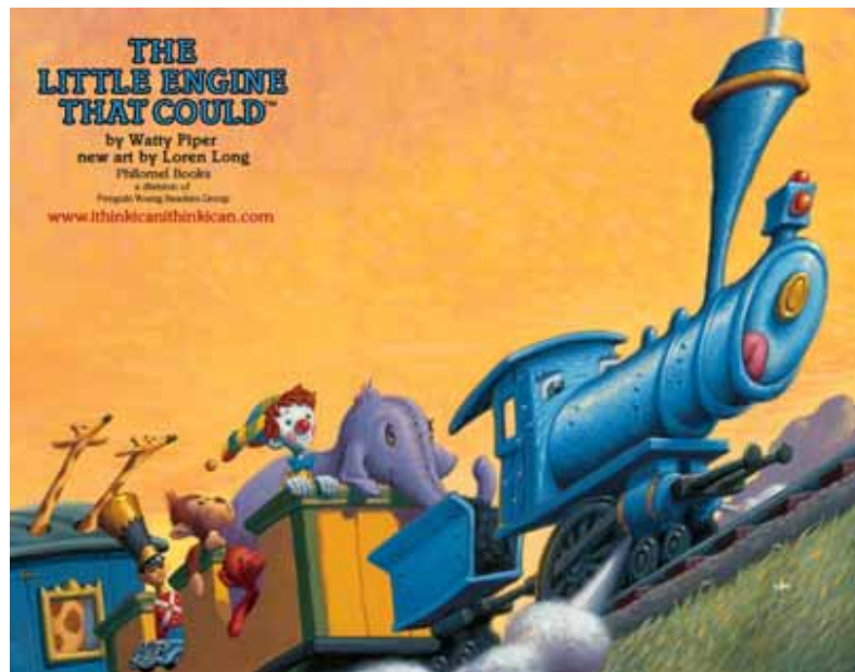
Little Engine that Could