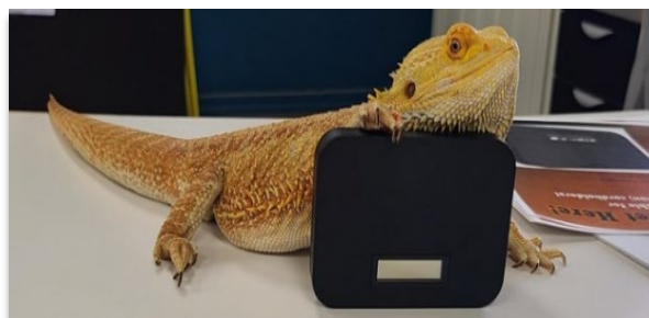
Hinton Library's mascot Toothless (a bearded dragon) helps promote the hotspots for loan in the library.

The program has won several awards, including NACDEP's National Innovation and Creativity Award in 2019 and the AAEEA's Distinguished Outreach Program Award in 2022.