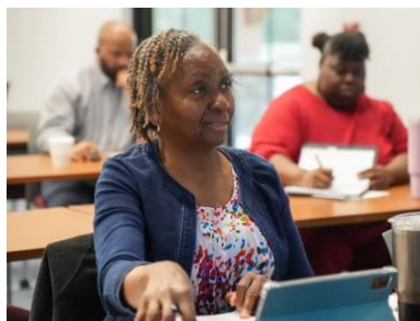
Business plan workshop series class participant

South Carolina State University 1890 Research & Extension's Community Economic Development (CED) Program implemented a five-week Rural Business Plan & Competition workshop designed to strengthen small rural and emerging entrepreneurs. The series blended systematic instruction, individualized coaching, and hands-on assignments that enabled participants to complete full, investment-ready business plans tailored to their ventures.