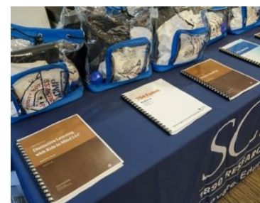
Completed business plans from series participants.